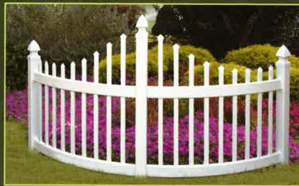
1½" CLASSIC RADIUS ACCENT CORNER

4' Radius Total 8' Length, 30 lbs. White Only