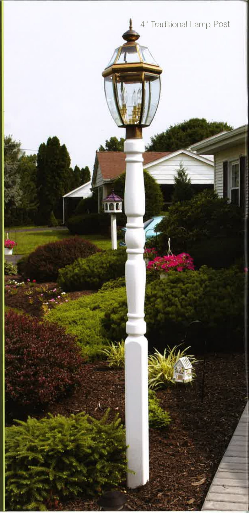
4" Traditional Lamp Post