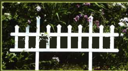
GARDEN PICKET FENCE