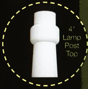
4" Lamp Post Top