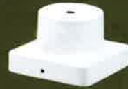
Lamp Post Caps Available in 4" & 5" Can be used with any 4" or 5" Square Post

Lamp fixture shown for image purposes only.