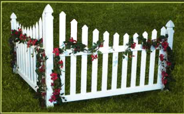
1½" OR 3" CLASSIC PICKET ACCENT CORNER