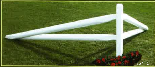
SPLIT RAIL ACCENT CORNER